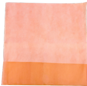
STAT-BLOC Headrest Cover