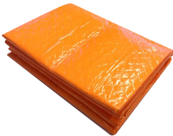
STAT-BLOC Table Sheet (Folded)

Linen sets can be included in custom turnover packs with other components such as bags, patient positioning straps, mops and wipes.