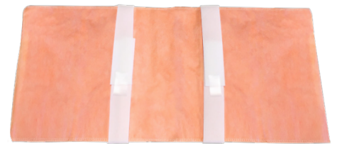
STAT-BLOC Armboard Cover