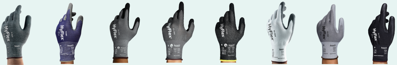
HyFlex® 11-531 HyFlex® 11-561 HyFlex® 11-571 HyFlex® 11-581 HyFlex® 11-543 HyFlex® 11-724 HyFlex® 11-754 HyFlex® 11-757